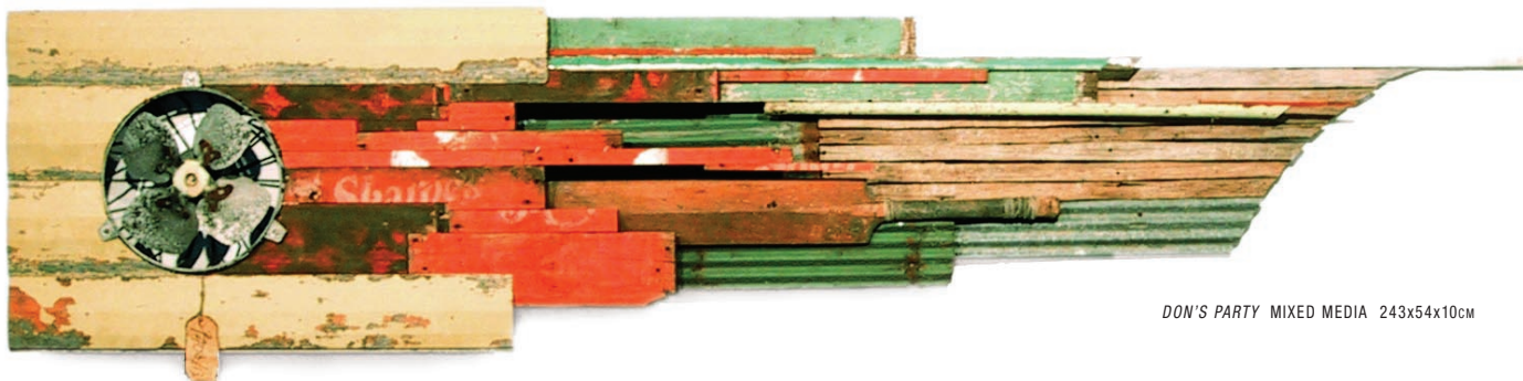
DON'S PARTY MIXED MEDIA 243x54x10cm

O P E N I N G 6 - 8 P M W E D 5 S E P E X H I B I T I O N 4 - 3 0 S E P 2 0 0 1