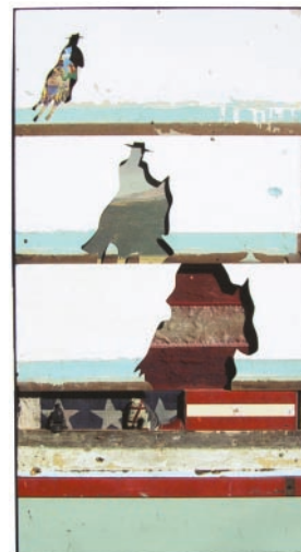
ONCE UPON A TIME IN THE WEST MIXED MEDIA 56x103cm