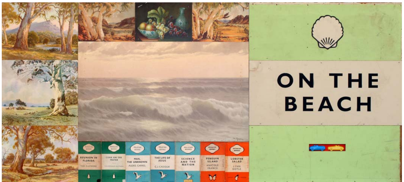
On the Beach II 2006 mixed media 188x86cm