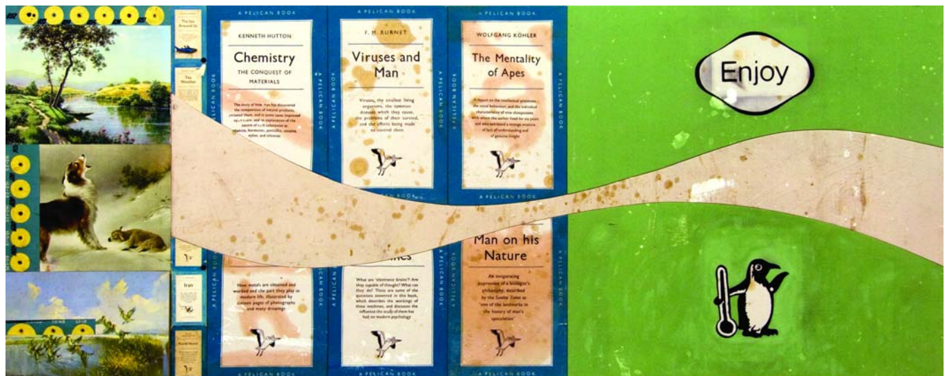
Enjoy Soylent Green 2006 mixed media 300x130cm

For more information, interviews or high resolution images contact James Powditch 0425 343 646 or james@jamespowditch.com.au and visit www.jamespowditch.com.au